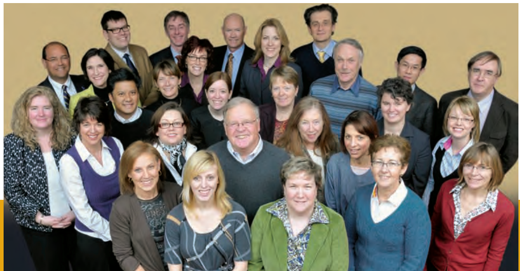
National Colorectal Cancer Screening Network

Despite the relative success of cervical cancer screening based on provincially supported Pap test programs, the Canadian Cancer Society estimated that, in 2008, 1,300 Canadian women would be diagnosed with cervical cancer and 380 would die from it. 4 This illustrates the need for additional measures of cervical cancer prevention and early detection.